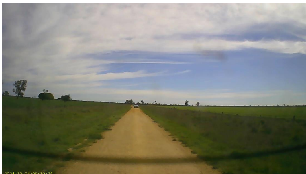
Some of the last of our driving along the border

The next day ... God must have held back the rain, as it started just as we were leaving (thankyou), but we had to drive home in the heavy rain after a week of beautiful weather ... and so ended the St Alfred's 4WD Club Border Track Trip a wonderful, memorable trip, so ably led by Dave and Sue.