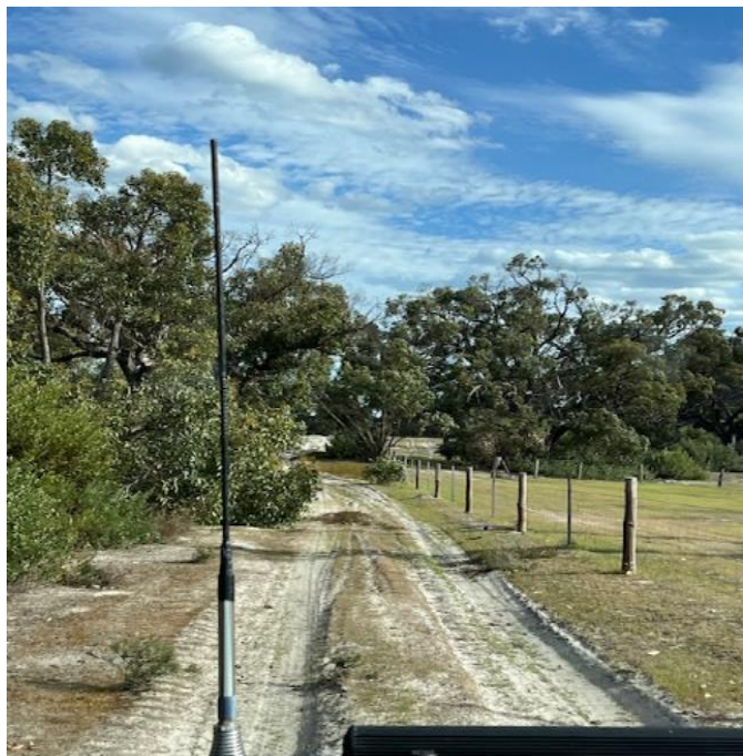
Victoria, left, SA right

Followed the bitumen road to enter Little Desert NP (LDNP) at 11:10. Track was