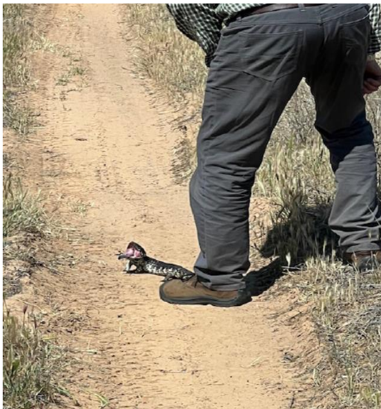
A stumpy tail!