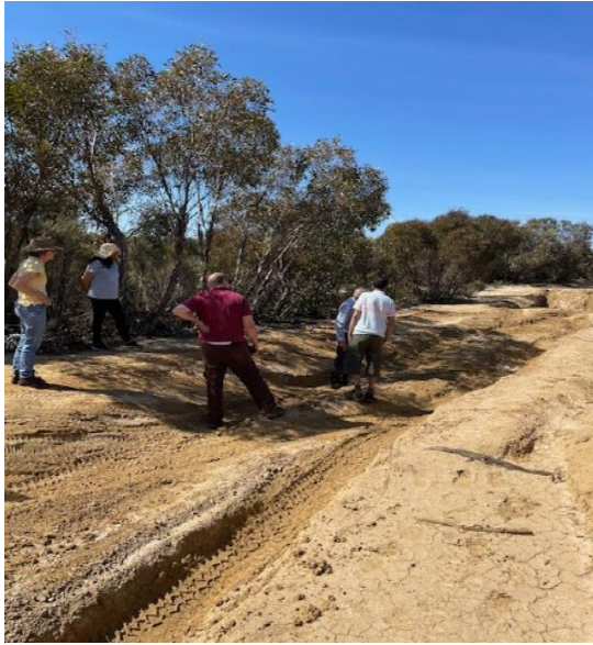
The big hole inspection

moguls and sand Dunes and a wonderful viewpoint on the highest dune at the Hensley Trig point. On this day we were mostly on the South Australian side and Ngarkat Conservation Park.