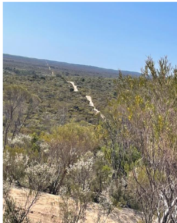
The view south along the track

David had paid our dues online when we had internet coverage near Pinaroo, at our lunch spot. The stumpy tail lizards were out sunning themselves, but we managed to move them off the track or drove around them. This was a very long day as the goal was to get out of Ngarkat Cons. Park over to the Victorian side where camping was free there. We made it to the camp site at the aptly named Red Bluff Nature Reserve. Here there is a huge campsite, well maintained but we were nearly chased off by wild bees seeking out any moisture in our vehicles while living in this arid region. Fortunately, as we arrived late and after the use of insect repellent, they left us in peace at dusk.