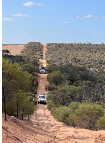
A view back along the track